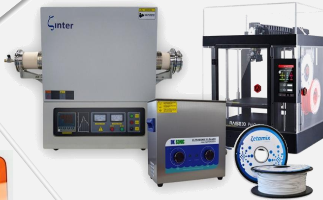
3D Ceramic Printer (Nanoe)