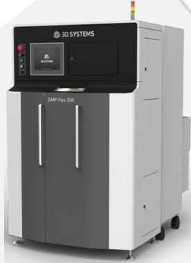
3D Metallic Printer (Flex 200)