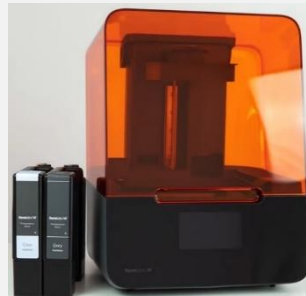
3D Polymer Printer (Formlab 3)